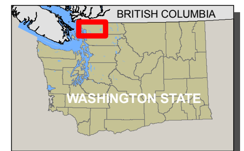
Figure 3 - 8